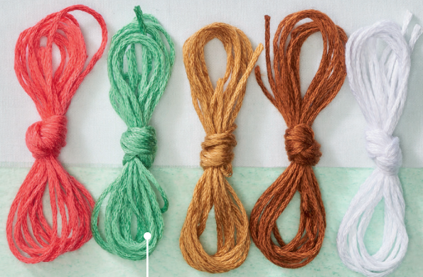
STRANDED COTTON Red, green, beige, brown, white