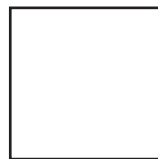
2cm square test square (for printing)