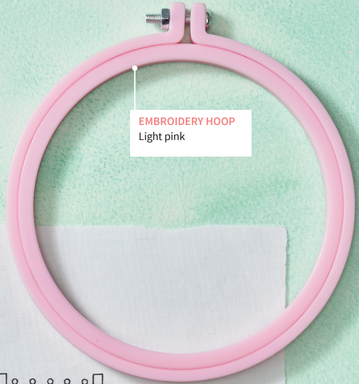
EMBROIDERY HOOP Light pink